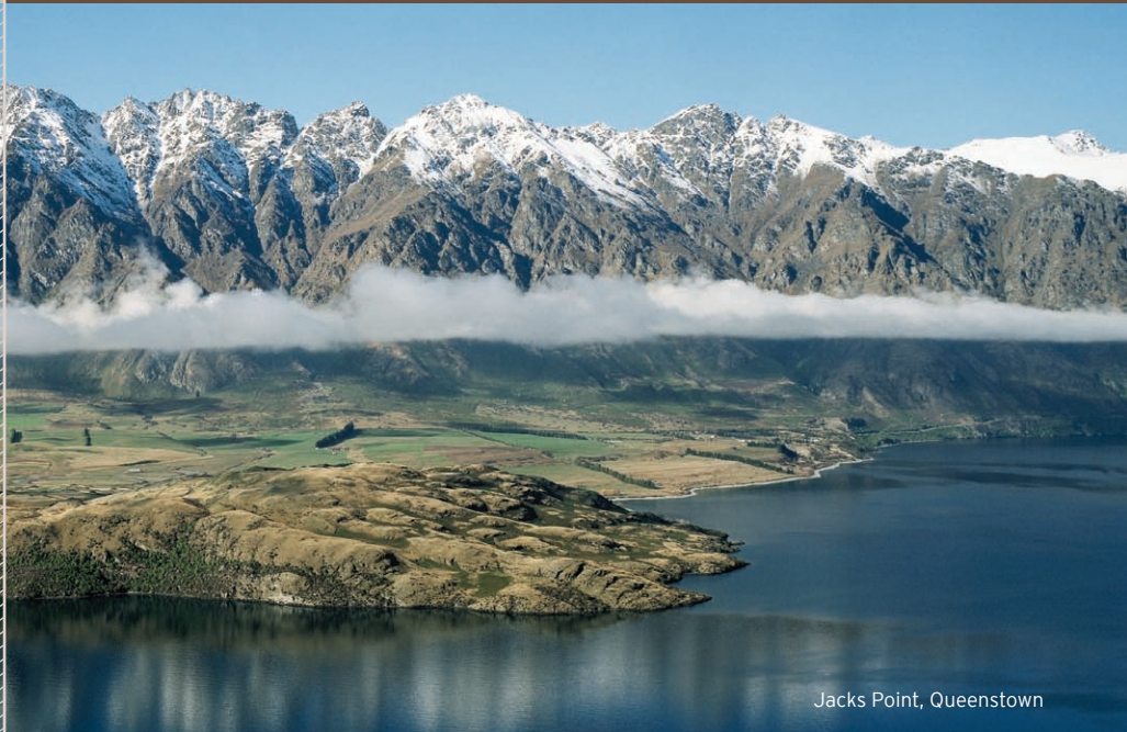
Jacks Point, Queenstown